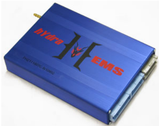
Large blue connector

Hydra EMS 2.7 ECU features a data transmission bus based on CAN on the front large blue connector. Here below you see the ECU on the left, connectors pinout on the right and connection table below.